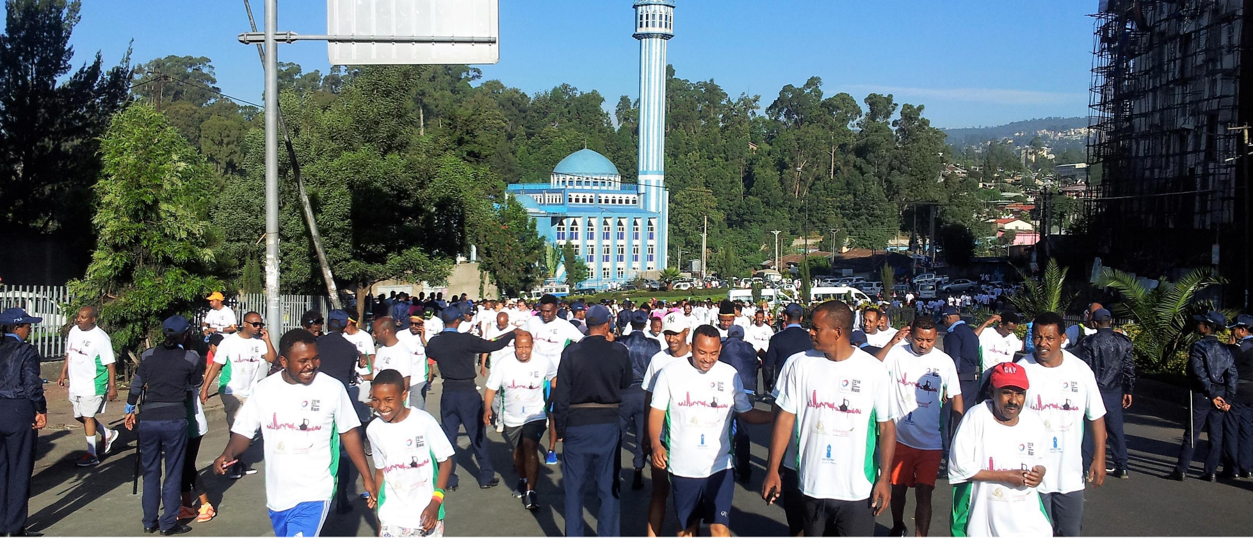
Excited participants heading for their starting corral after passing through the security frisking station