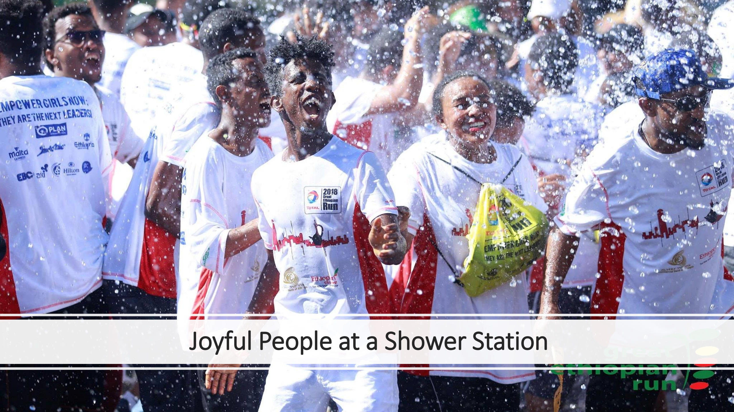
Joyful People at a Shower Station